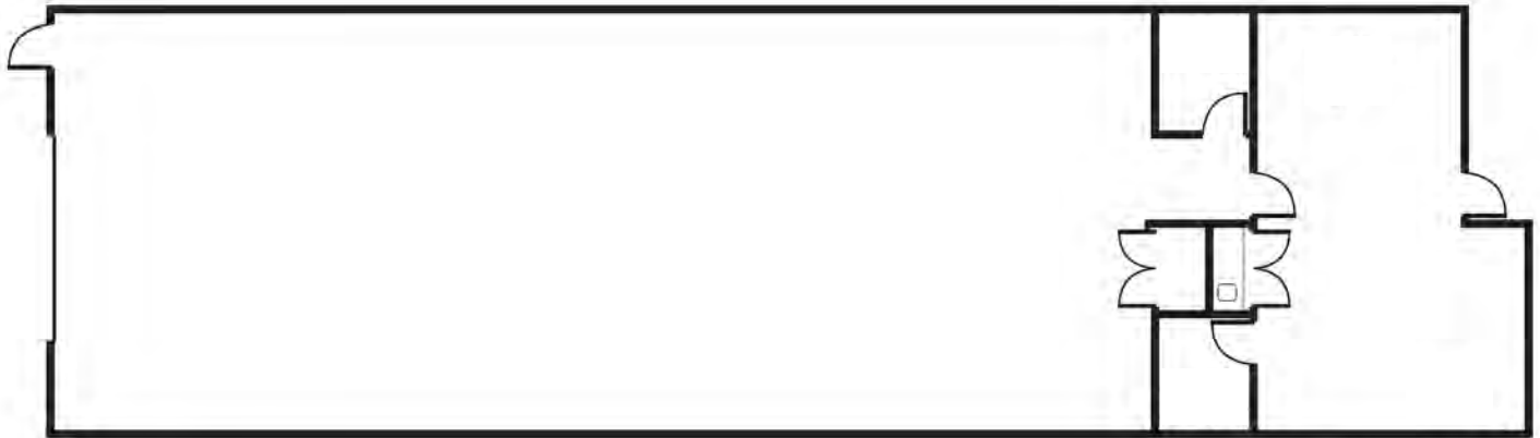
Map to scale. Not as built.